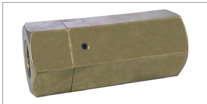
15 Venturi Mixer 17C009-0000