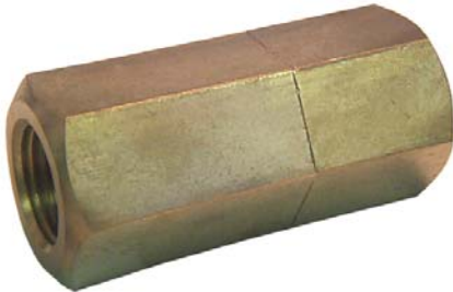
C-80 Fire Check 18A002-0000