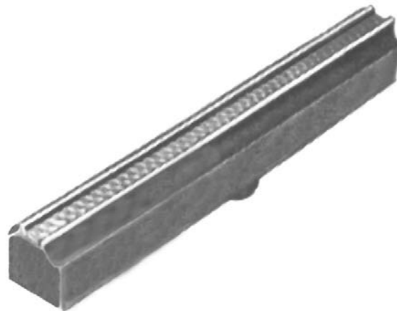
T-205 12" Burner with 3 Rows of Porting 20B015-3000