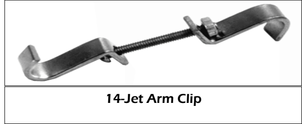
14-Jet Arm Clip

arm-tensioners. The arm clips use a nut and bolt to bring together the clips holding the arms. This works well for a set positioning of the arms but complicates re-adjustment of the heads. After many repeated tightening and loosening of the arm clips which have been inadvertently “heat treated” by use of the burner, their effectiveness is reduced and will need periodic replacement. The arm-tensioner uses two holding brackets which can be tightened or loosened by a single hex nut located between them. With this system it is easier to positively adjust the sidearms and heads to new positions and positioning is not reduced.